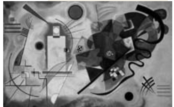
Yellow-Red-Blue, Kandinsky, 1925

The spirit that will lead us into the realms of tomorrow can only be recognized through feeling.