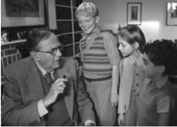
Anton Rodgers as C.S. Lewis.