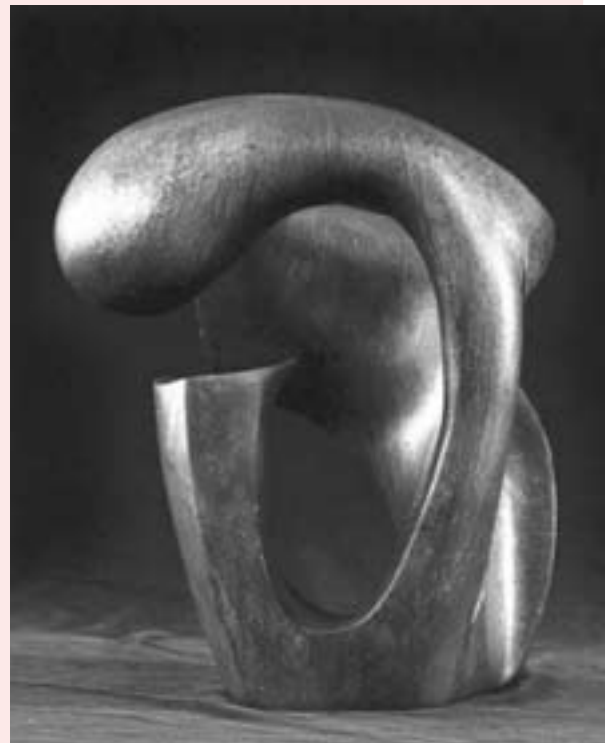
Untitled, abstract form, bronze patina, 15" high

I find myself compelled to pursue interactive and spontaneous play within my own work but also within the sphere of other local creators. As an active believer in and developer of artistic community I enjoy interaction with those who have different skills. One time when a particular stone would not open up for me to any design, a friend who is a dancer proposed an alternative approach. By